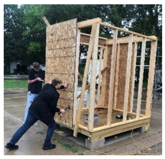
Southwest Metro Youthbuilders constructing a booth.