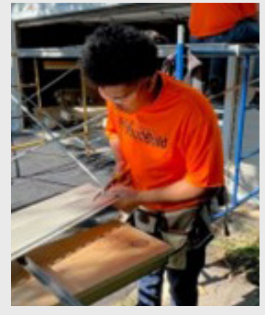
Meko building a house

Since 2005, St. Cloud Youthbuild has constructed sheds, playhouses, raised garden beds and more than 60 homes with Central Minnesota Habitat for Humanity for lowincome families. This year's builds include: