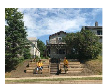
Retaining wall project

The Youthbuild crew worked along-side of Itasca County Habitat for Humanity in 2022 building three new affordable