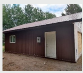
AEOA workshop building

"While being in the Youthbuild Program, I am learning a direct path to understanding my direction to get a job in the 49ers."