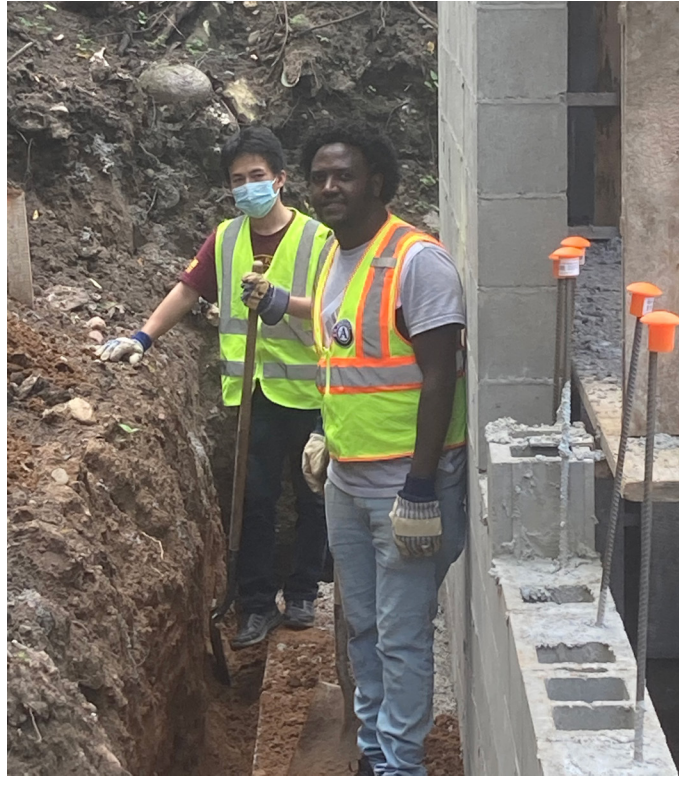
Youthbuilders from The Change, Inc. digging a foundation.