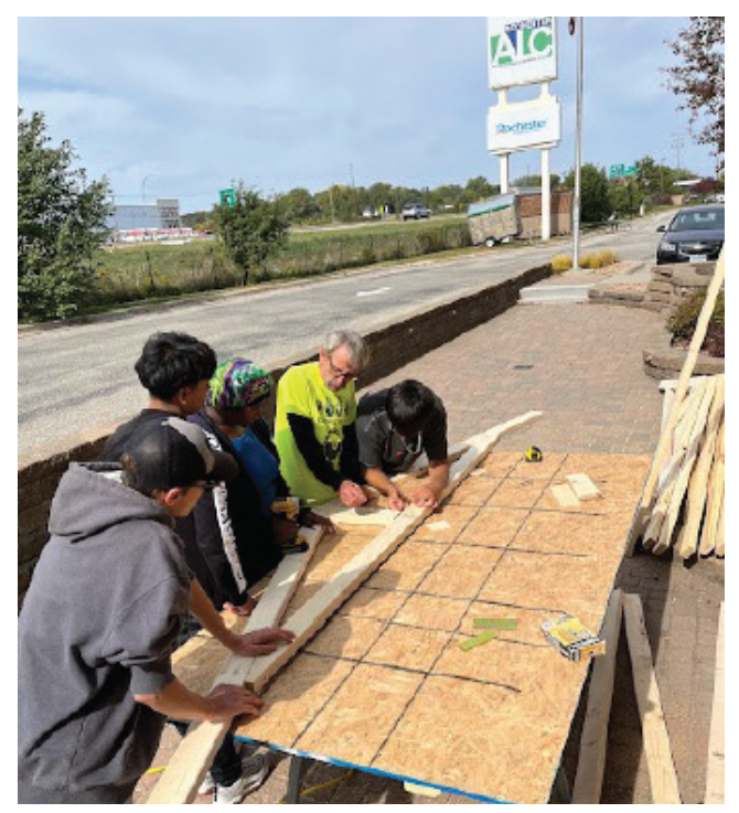
Youthbuilders learning how to measure while framing walls.