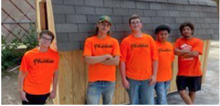
Career Solutions storage shed