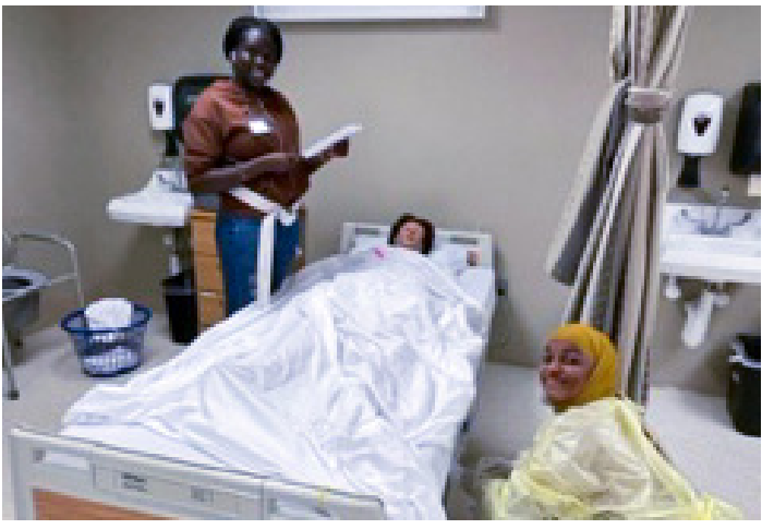
Youthbuild students in the CareerOne Health Care track