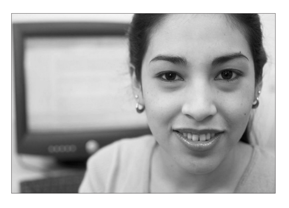
<sup>3</sup>Not only ethnicity, but also the timing of migration to the U.S. varies within this group, with implications in terms of knowledge of English, educational background, and overall skill level.

But just how much does major matter? Figure 3 represents the breakdown of below-Bachelor's completers by major in each racial group. We've selected the majors that are illustrative of the impact of educational choices on wage outcomes: Science, Technology, Engineering, and Math (STEM) programs combined, registered nursing (RN) training, licensed practical/vocational nurse