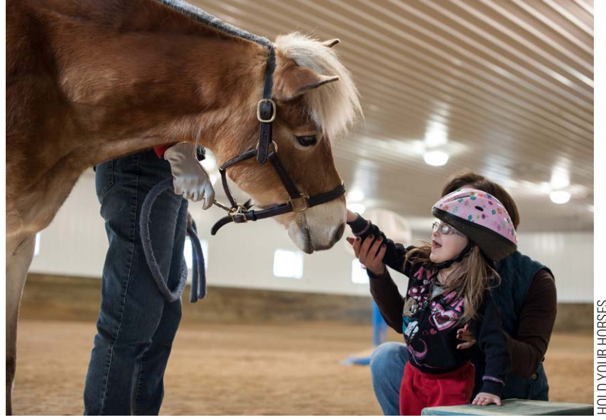
A Hold Your Horses client and Lily the pony shared some time together. The pony is retiring.

Occupational therapists provide hippotherapy at Hold Your Horses. Used as a treatment strategy, the horse provides multi-dimensional movement