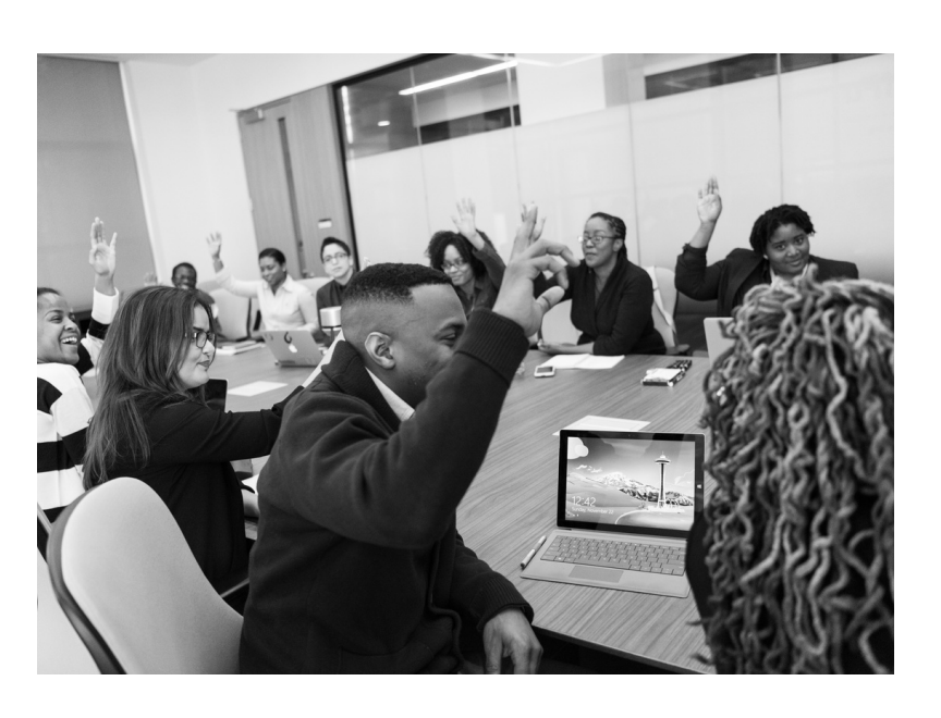
Immigration and Environmental Education Justice Justice