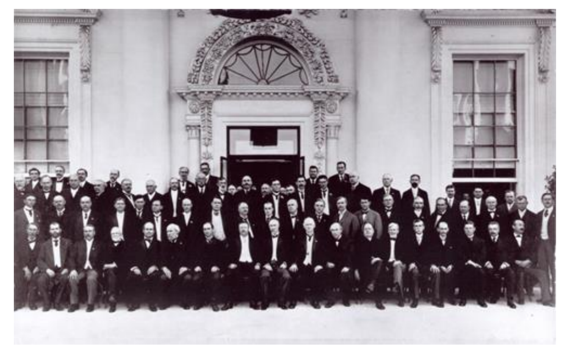
Photo: The first meeting of the nation's governors, convened by President Theodore Roosevelt in Washington D.C., 1908.

The May 1908 meeting of President Theodore Roosevelt and governors led to the creation of the National Governors Association.